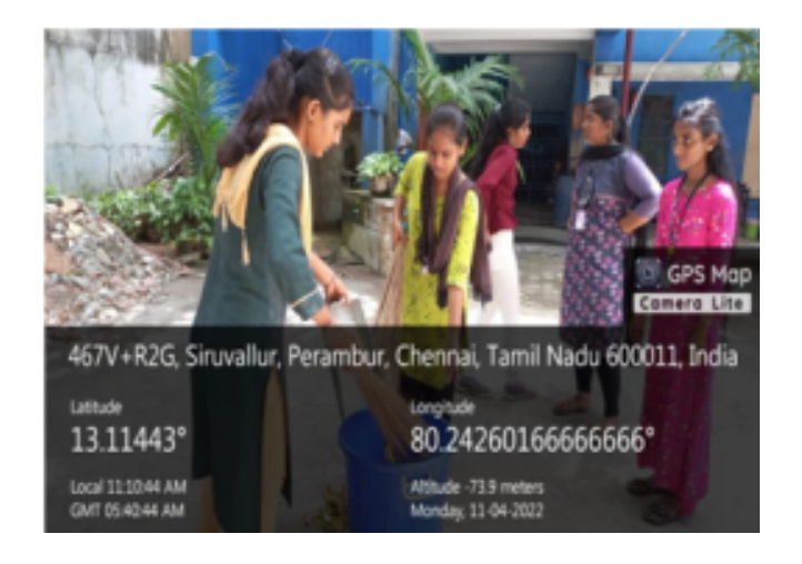
The volunteers of SBA team created awareness and engaged with IX STD students of St Mary's Boys School.