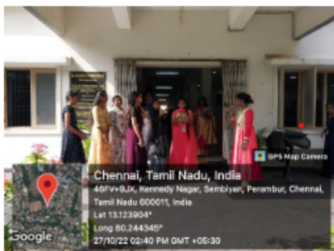
Pollution created by burning crackers