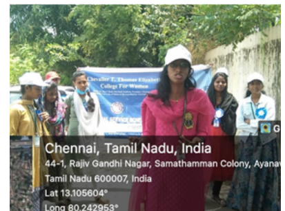
Drug Awareness through Street Play