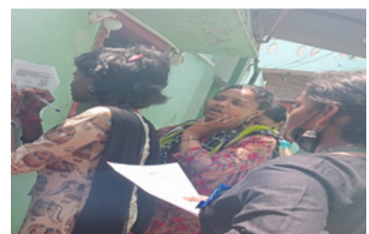
Survey on unemployment