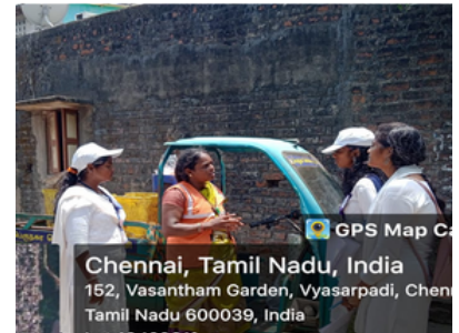
Interacting with Scavenger of Greater Chennai Corporation