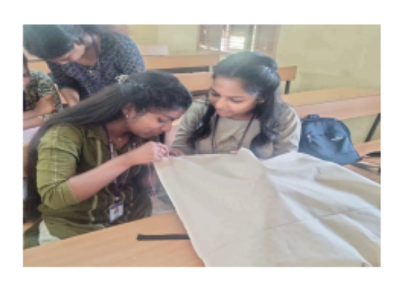
(Students listening to instruction and making the blanket)