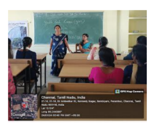
( Resource State the importance of the day)

( Resource Person address the Students )