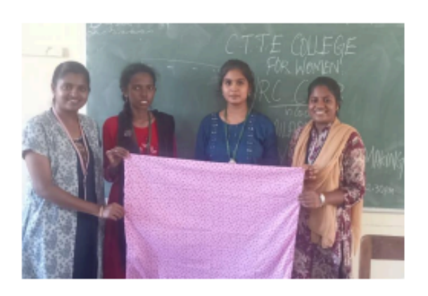
(Outcome of the activity)